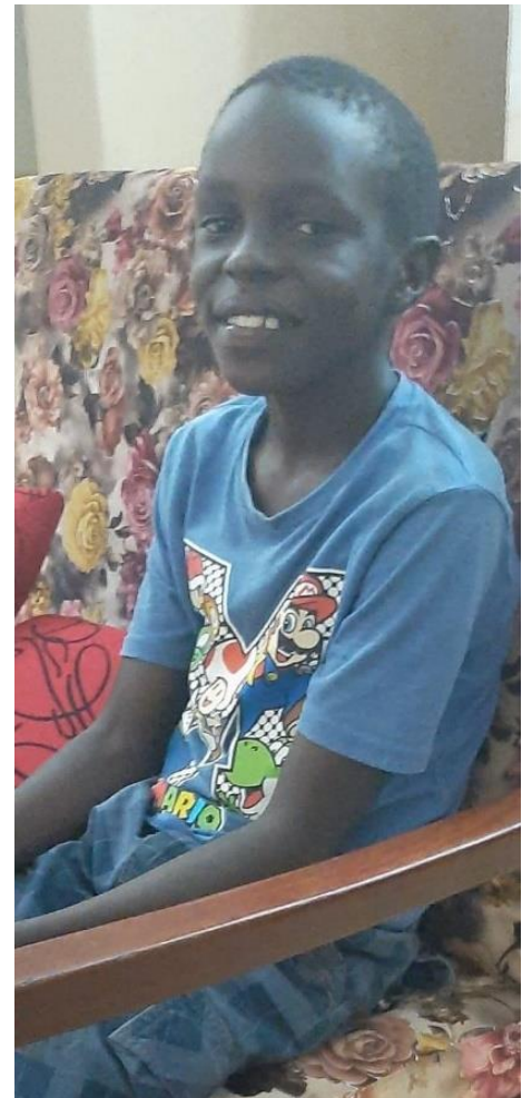
Yubo on the couch