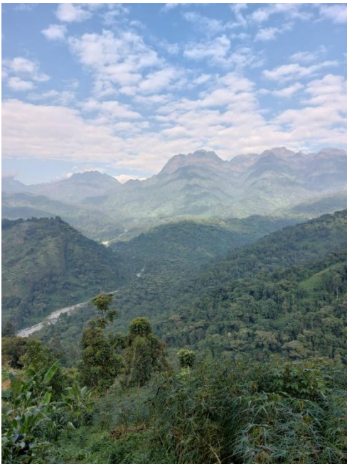
View from the mountain

Accompanied by 2 guides we went for a walk through the forest and near the river on the first day, on the second day we climbed a mountain.