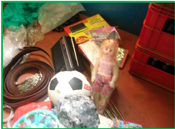
Presents and soda's

It was raining cats and dogs in December, but since then not a drop of rain has fallen. The heat is enormous, 34 C., sun, not a cloud in the sky. Then, suddenly, a devastating sand storm. There flew the roof of the girl's house through the air. The tv antenna also didn't survive. Tja.